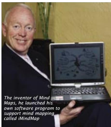
The inventor of Mind Maps, he launched his own software program to support mind mapping called iMindMap