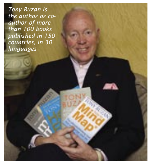
Tony Buzan is the author or co-author of more than 100 books published in 150 countries, in 30 languages