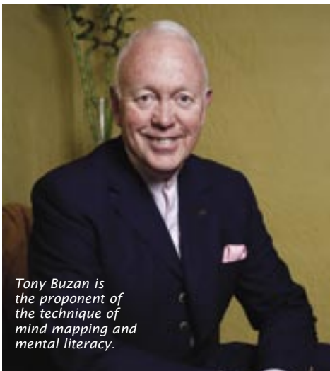
Tony Buzan is the proponent of the technique of mind mapping and mental literacy.

For further information, visit www.buzanworld.com